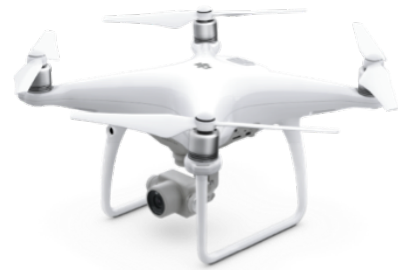
Figure 1: Drone DJI Phantom that will be used during the mission.

The combined use of drone (Figure 1) imaging and satellite imagery provides a complete mapping. The satellite images give an overall and coherent view of a relatively large area. The photos taken by drones are more detailed and give additional information. These data will be digitally processed in order to obtain a complete map of the area surrounding the MDRS.